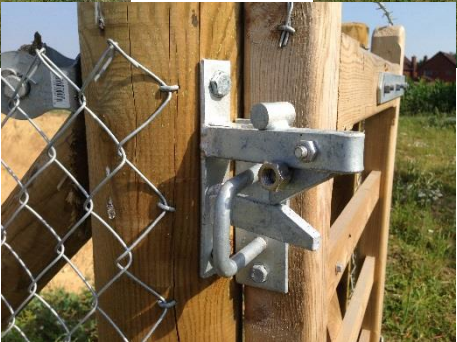
Tunstall Flood Basin